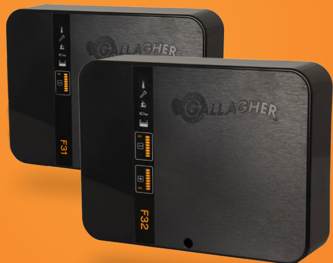
F32 Fence Controller G21940 - Dual Circuit