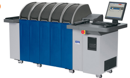
DataCard MX2000 Printer

Gallagher delivers rapid turnaround of ISO card printing and encoding requests with outstanding quality.