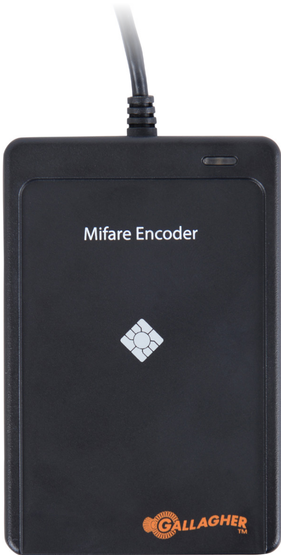
Encoder Unit (Mifare)