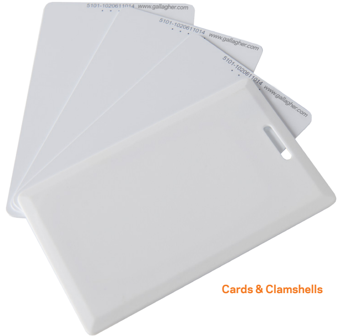
Cards & Clamshells